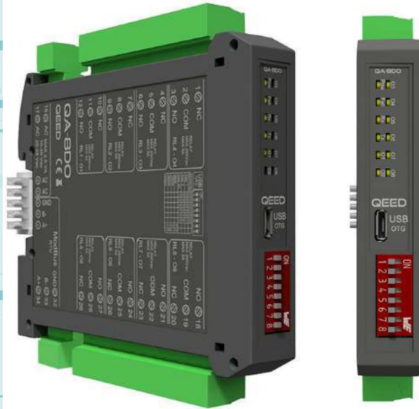
The images/schemes proposed are to be considered indicative and not binding

I/O Digital Modbus Slave Interface, USB configurable, DIN rail mounting, 3-way galvanically isolated, universal power supply AC/DC, n° 8 DIGITAL OUTPUT RELAYS.